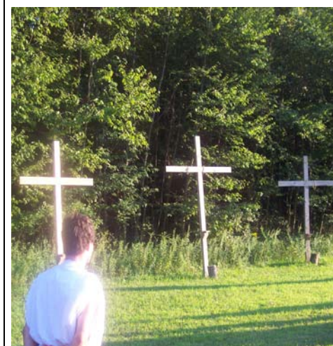
Crosses from Crossroads

If you cannot reach Pastor Moeser (609-497-0712) than contact the church office.