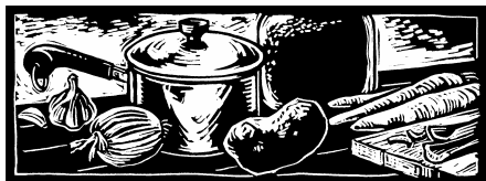
S · O · U · P S · U · P · P · E · R

Each Wednesday we will gather for a Soup Supper at 6:30 PM and worship together at 7:15 PM.